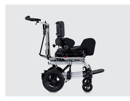
High-low:xo indoor and outdoor frames